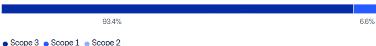
Figure 1 Emissions in financial year ending 2025, split by Scope.